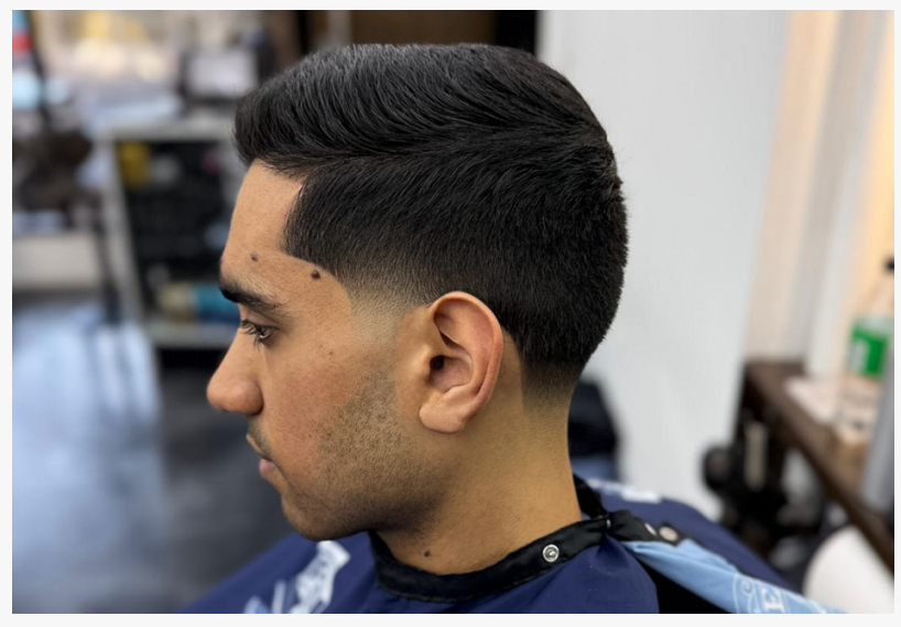
Haircut & Beard Trim

The business also emphasizes scalp health, offering Hair Wash & Condition services for $10. These are often added to haircuts or treatments for a clean, product-free base before styling. Regular hair washing can be especially beneficial for clients who opt for tighter fades, where scalp exposure is more visible.