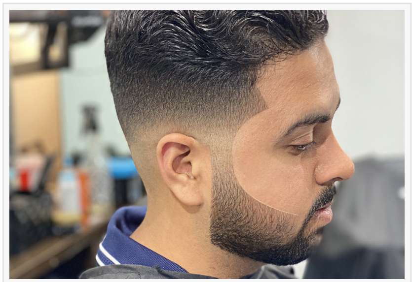
Hair cut and Royal Shave

Understanding that hair and skin care go hand in hand, PHD BARBERS also offers facial treatments to enhance grooming routines. The Cleansing Facial ($45) and Black Peel-Off Mask ($20) are designed to remove impurities and refresh the skin, often complementing the clean look of a freshly executed fade.