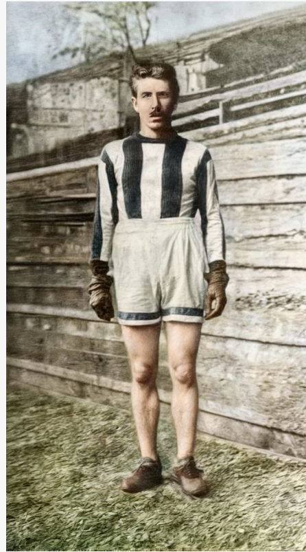
Colorized archival photograph of Pat White, taken during his competitive peak in the early 20th century.