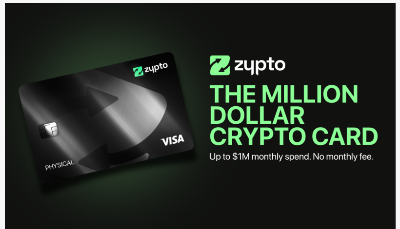
The Million Dollar Crypto Card - Zypto Premium VISA Crypto Card

ŁÓDŹ, ŁÓDZKIE, POLAND, July 10, 2025 /EINPresswire.com/ -- Blockchain fintech innovator Zypto has unveiled the Premium Physical Visa Crypto Card, a sleek matte-black card that lets users load and spend up to 1 million USD per month loaded from their DeFi wallets, making it quite possibly the best crypto card on the market. The "load-on-demand" card keeps assets in self-custody until the user decides they want to spend it, signalling how far crypto payments have matured since the industry's speculative early days.