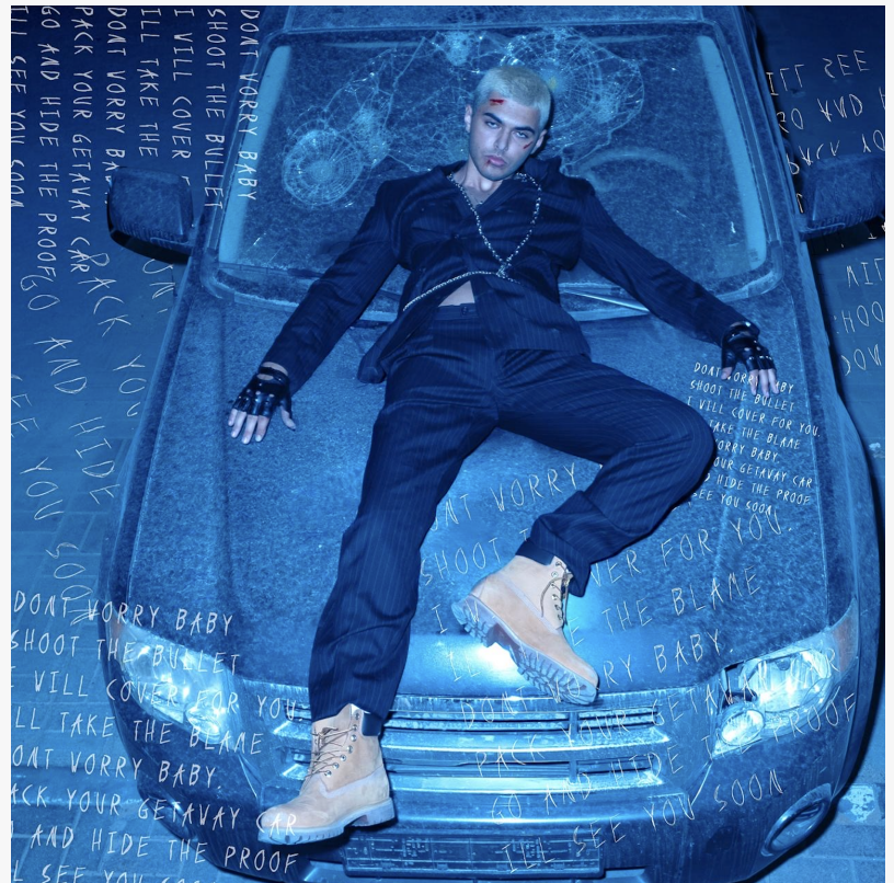
Orlando Kallen, "Don't Worry Baby" - cover art