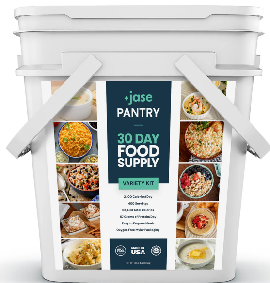
Jase Pantry 30 Day Supply