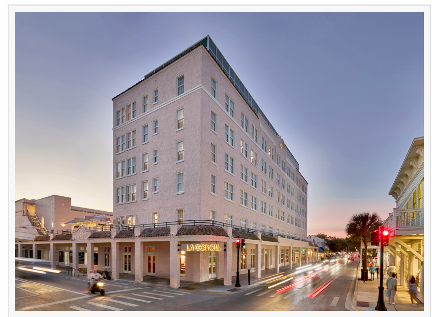
Exterior of La Concha Key West.

La Concha Key West Media Contact The Mayfield Group LaConchaKeyWest@MayfieldPR.com