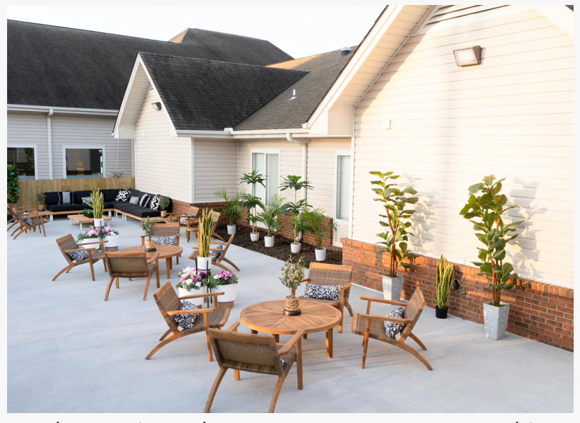
Outdoor Patio at The Haven Detox - West Memphis