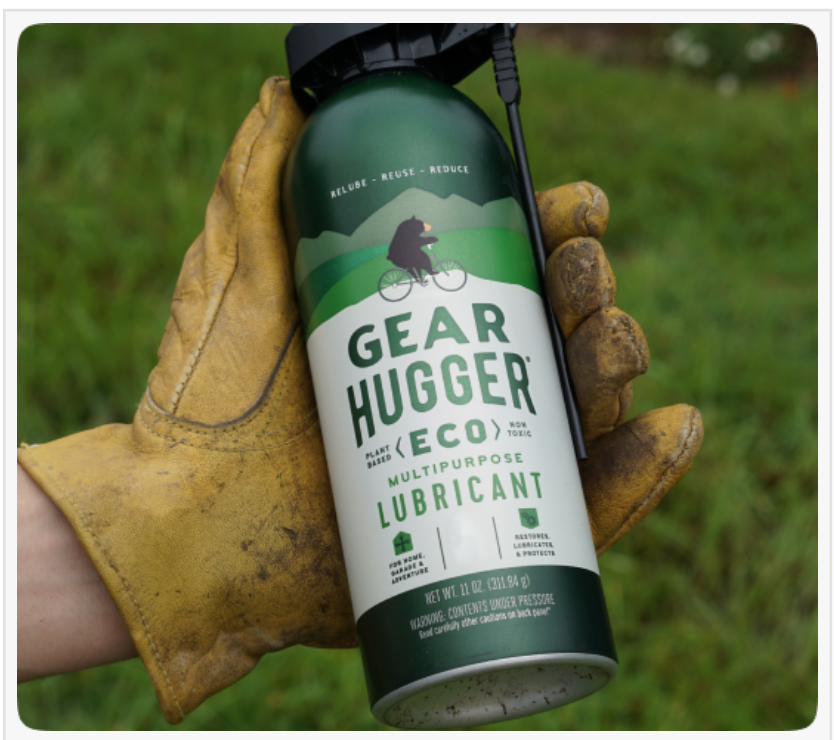
Gear Hugger Multipurpose Lubricant

As a brand built to eliminate petroleum from everyday routines, Gear Hugger is leading the shift toward cleaner, safer alternatives in garages, homes, and outdoor gear kits across the country.