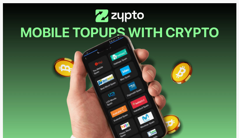
Zypto Launches Mobile Recharge with Crypto Service

ŁÓDŹ, ŁÓDZKIE, POLAND, July 11, 2025 /EINPresswire.com/ -- Zypto has just announced the release of Zypto Crypto Mobile Top Ups , a service that lets customers purchase prepaid airtime and data for prepaid cellphones across 800+ operators in 170 countries using more than 100 cryptocurrencies. The on-chain checkout keeps funds in user-controlled wallets until the moment of purchase, extending Zypto's mission to make crypto usable for everyday payments.