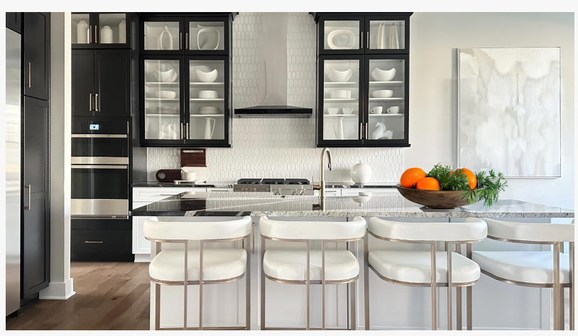
New Construction Home Staging