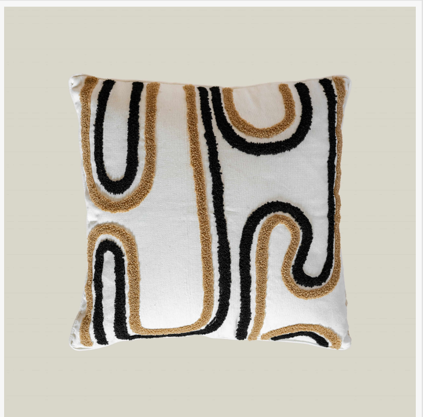
San Jose Cotton Boho Cushion