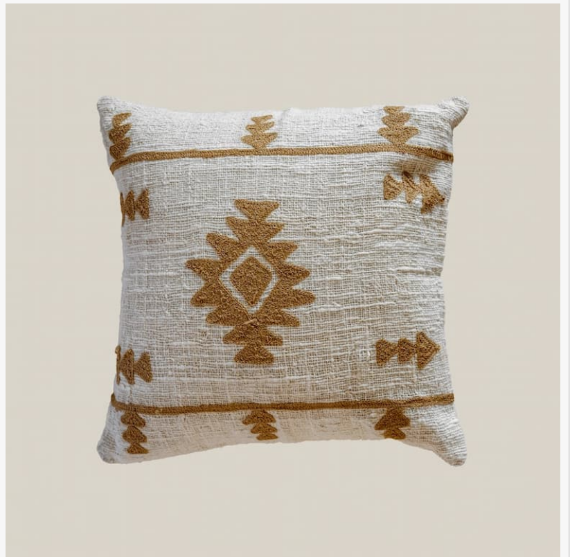
Pedro Handmade Boho Cushion

This press release can be viewed online at: https://www.einpresswire.com/article/830505337