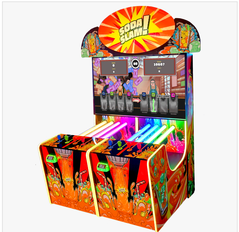
Soda Slam! Deluxe model

For more information or to place an order, visit https://alan-1.com or contact your local arcade