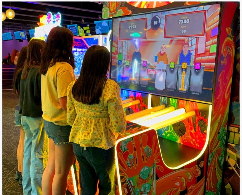
Soda Slam! on location test