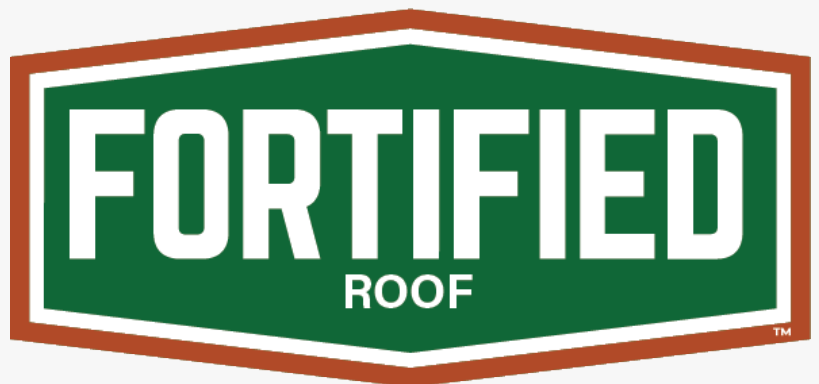
FORTIFIED Home Roof Program

The FORTIFIED Home program was developed through a partnership between IBHS and Architectural Testing, Inc. (Intertek-ATI) to help building professionals achieve high standards of