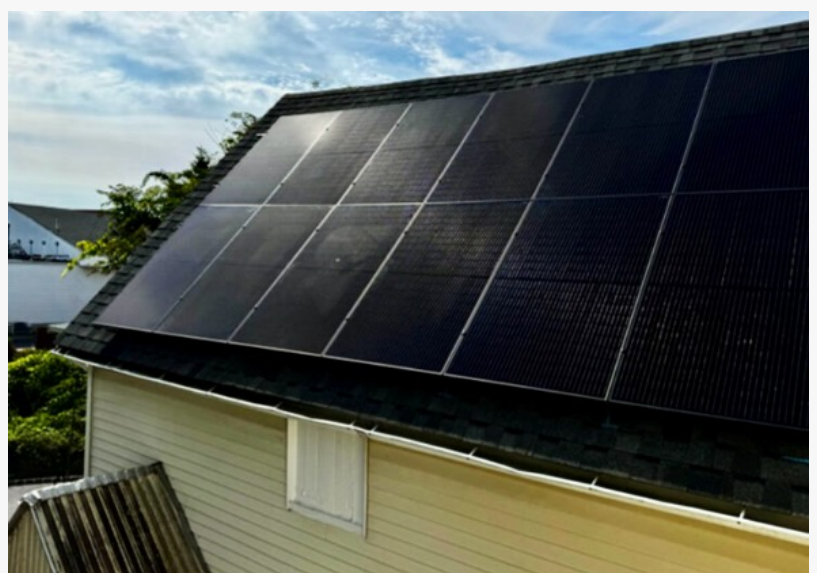
Suncovia Solar Installation