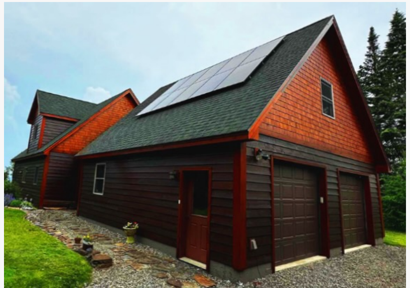
Maine Residential Solar