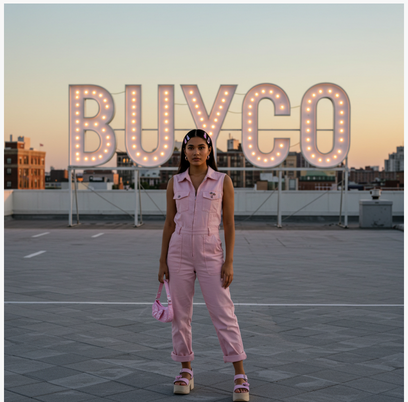
Step into 2025 with Buyco's sleeveless Y2K jumpsuit—bold, breathable, and body-flattering.

□ Celebrating Bold Self-Expression Through Retro Aesthetics