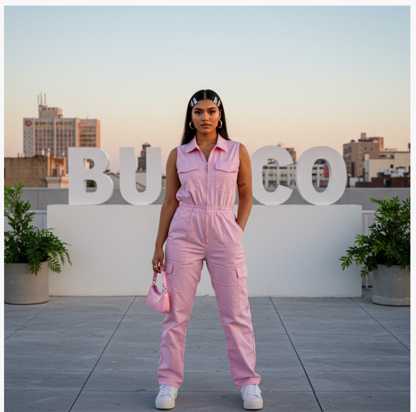
Throwback style meets modern comfort. Buyco's pastel romper is a summer essential.

Buyco’s new collection is optimized to meet this trend with products that perform in real life, unlike many fast-fashion alternatives.