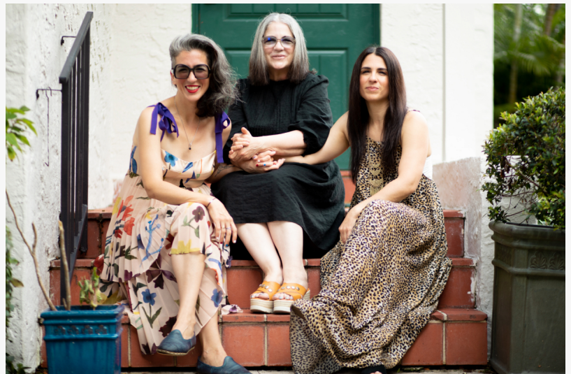
Never the Empty Nest