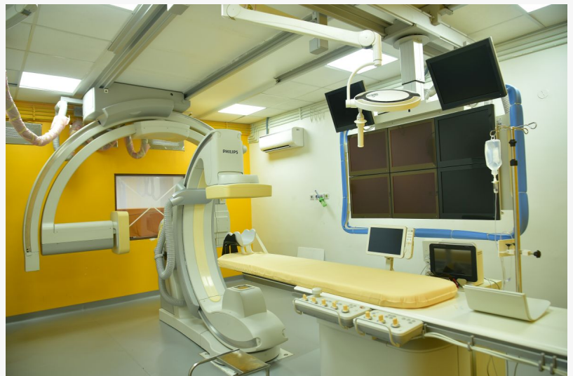
The advanced biplane cath lab at Dr. Rao's Hospital, designed for precision neurovascular procedures and minimally invasive surgeries, first in Andhra Pradesh and Telangana in India.