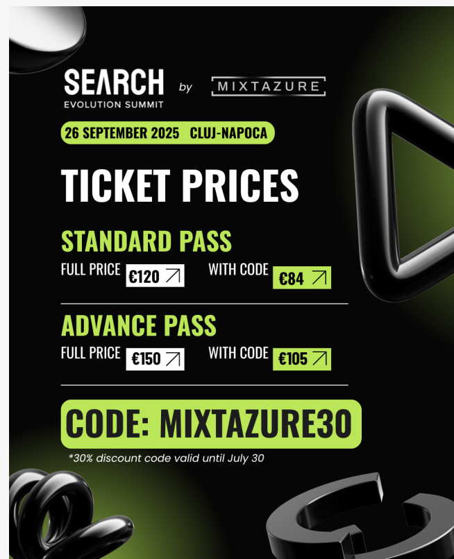
Ticket prices for Search Evolution Summit