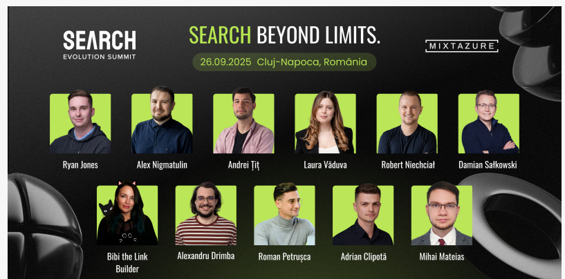
Speakers at the Search Evolution Summit