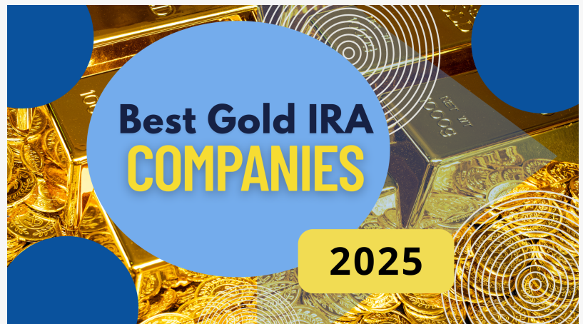
Best Gold Dealers for 2025

FORT LAUDERDALE, FL, UNITED STATES, July 14, 2025 /EINPresswire.com/ -- In a year defined by economic uncertainty, inflationary pressures, and market volatility, the demand for precious metals continues to grow—especially among retirement-focused Americans.