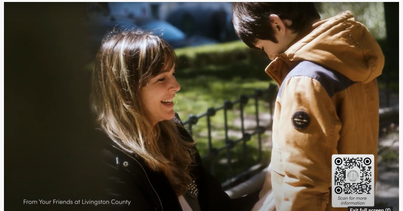
Livingston County Anti-Stigma - Happiness is Possible