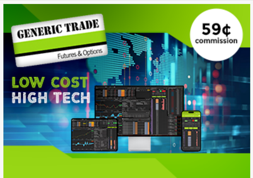
Generic Trade discount broker

Generic Trade is a technology-driven, discount brokerage firm registered with the Commodity Futures Trading Commission (CFTC) and a member of the National Futures Association (NFA). Specializing in online futures and options trading, Generic Trade offers a flat 59¢ commission per side, per contract for all accounts—no tiers, no minimums, and no hidden fees. The firm provides fast, reliable execution through a state-of-the-art trading infrastructure.