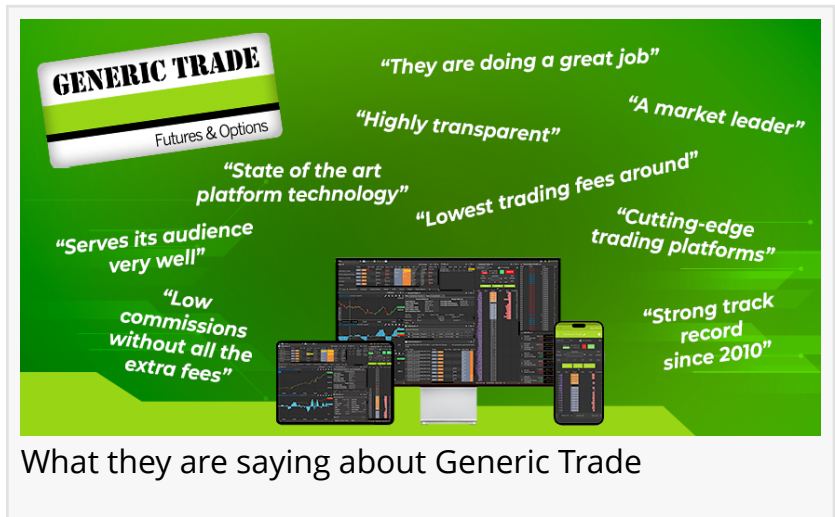
What they are saying about Generic Trade

CHICAGO, IL, UNITED STATES, July 15, 2025 /EINPresswire.com/ -- Generic Trade, a leading discount brokerage specializing in online futures and options trading, marks its 15th anniversary of offering one of the industry's most transparent and cost-effective pricing models: 59-cent commission per contract, per side for every account, large or small.