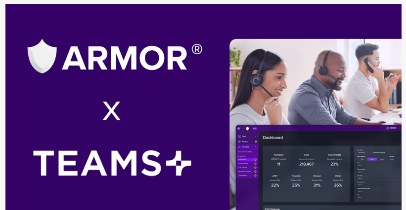
ARMOR® and Teams Plus partner to improve outbound call integrity

The partnership also includes access to ARMOR® analytics and ARTHUR, a first-of-its-kind AI Answer Rate Technician that synthesizes call performance data, identifies patterns and anomalies, and surfaces actionable insights to help teams fine-tune their strategies and drive