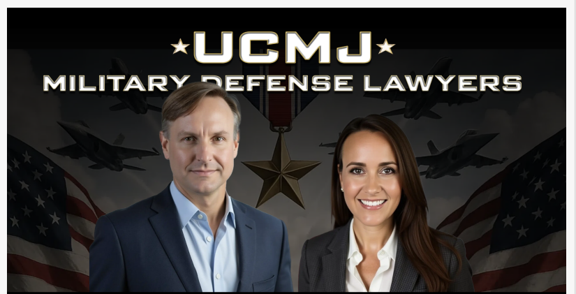
Top Military Defense Lawyers UCMJ Experts

• Provide legal strategies that go far beyond base legal and public defenders