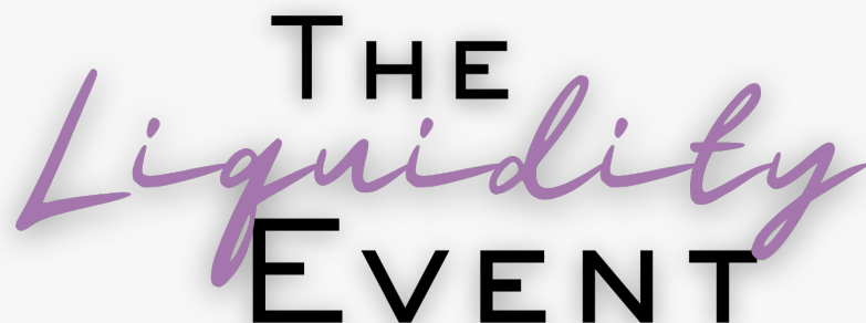
The Liquidity Event