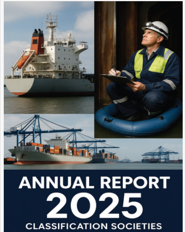
2025 Global Classification Society Report