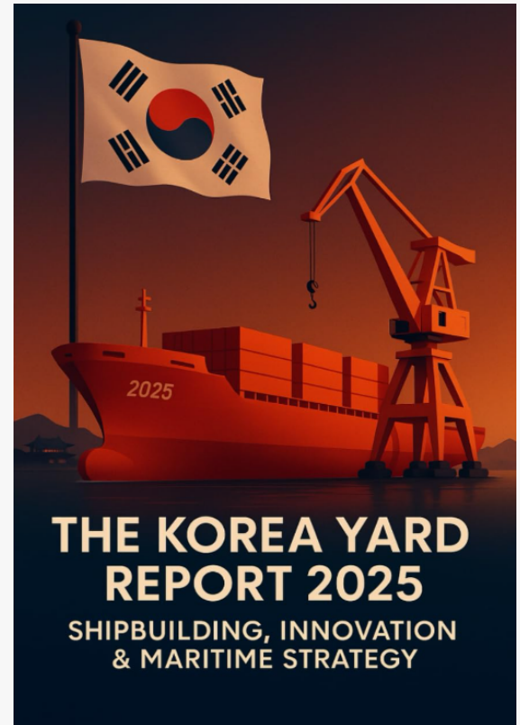
The Korea Yard Report 2025: Shipbuilding, Innovation & Maritime Strategy