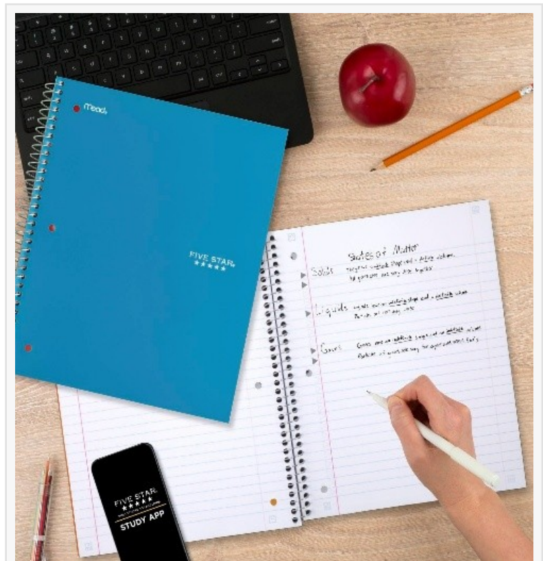
Back-To-School with Five Star Study App

Five Star believes in the love of learning – in the power of a notebook filled with goals, scribbles