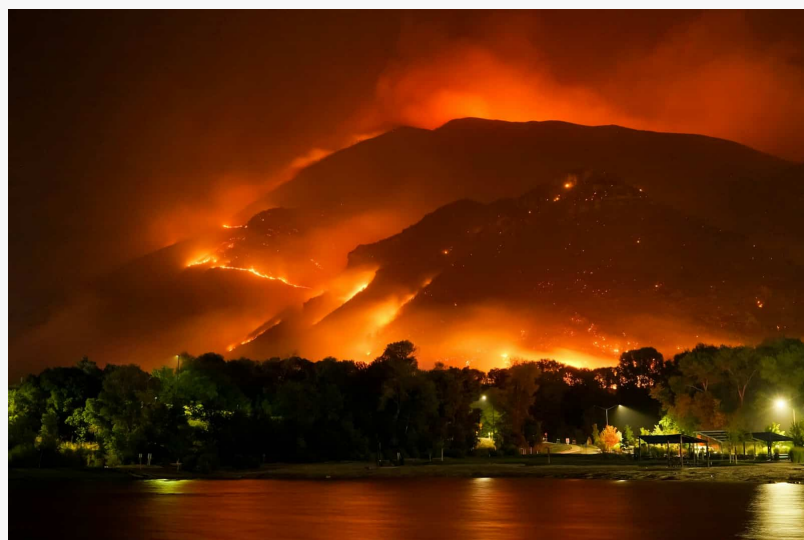
Summer fires in Greece