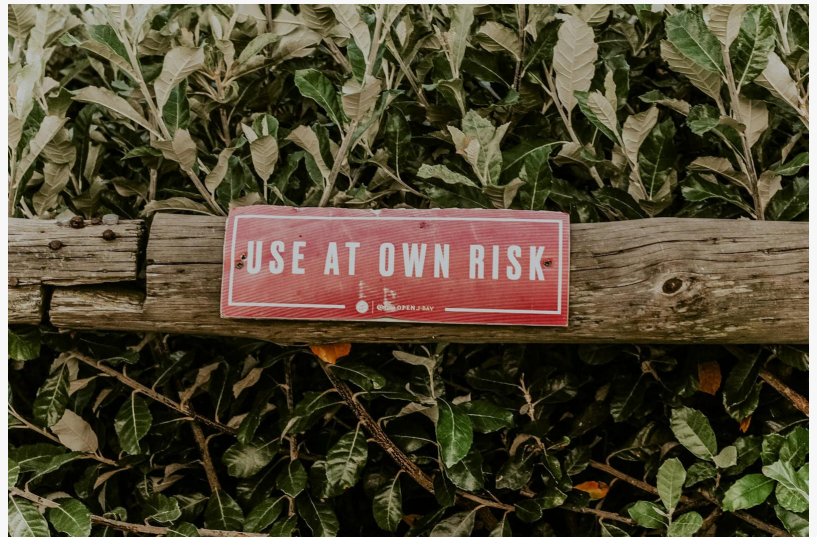
Use at own risk

international investors face a volatile global real estate market, the independent analysis platform PropertyFinder.Bg has officially launched its "Global Property Risk Analysis" hub — a new, comprehensive resource designed to expose the critical environmental and systemic risks that property brokers often fail to disclose. The series provides data-driven intelligence on popular investment hotspots, empowering investors to look beyond the glossy brochures and protect their capital.