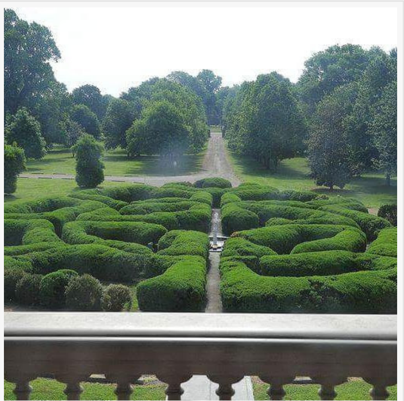
Two Rivers Garden Maze

Matt Bjorke PLA Media matt.bjorke@plamedia.com