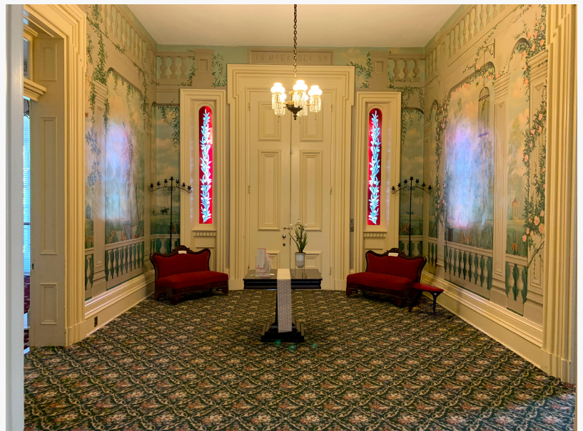
Two Rivers Mansion, Interior Foyer