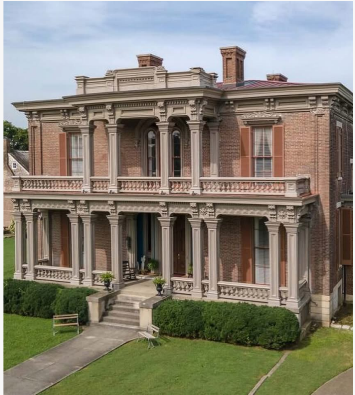
Two Rivers Mansion