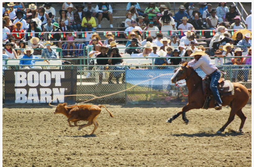
BPIR Oakland Rodeo in Castro Valley, CA

OAKLAND, CA, UNITED STATES, July 16, 2025 /EINPresswire.com/ -- From edge-of-your-seat competition to heartfelt community impact, the Bill Pickett Invitational Rodeo (BPIR) delivered two thrilling shows in Castro Valley this past weekend, captivating audiences with its signature mix of cultural celebration and cowboy grit.