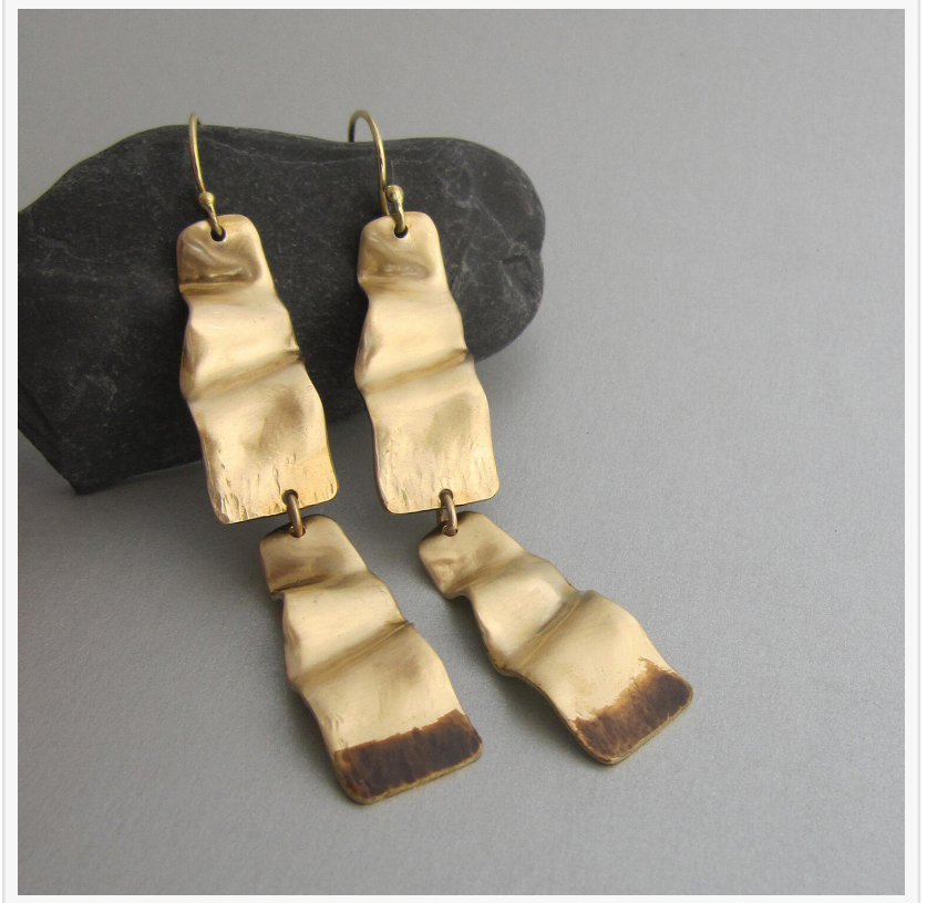
Terremoto earrings — one-of-a-kind, handcrafted pieces by Maddalena Bearzi, featured in And Just Like That... Season 3.

online at <u>www.maddalenabearzi.com</u> and in select shops and galleries in California and internationally. With no two pieces alike, each creation invites wearers to embrace slow fashion and wear something truly original.