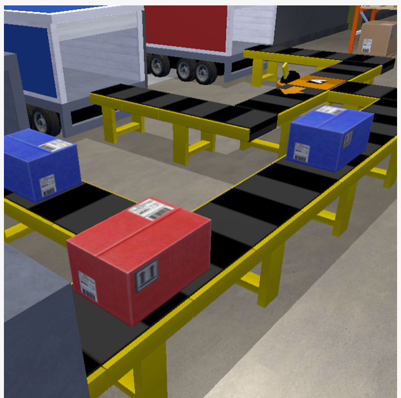
Freight Sorting Challenge icon