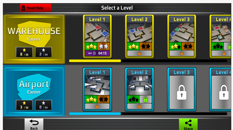
Freight Sorting Challenge level select