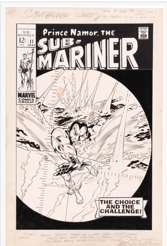
Gene Colan (1926-2011) pen and ink original art for cover of Sub-Mariner #11, Marvel, March 1969. Extensive handwritten notes on margins, including instructions regarding coloring for cover. Artboard size: 11 5/8in x 17.5in. Estimate: $20,000-$35,000