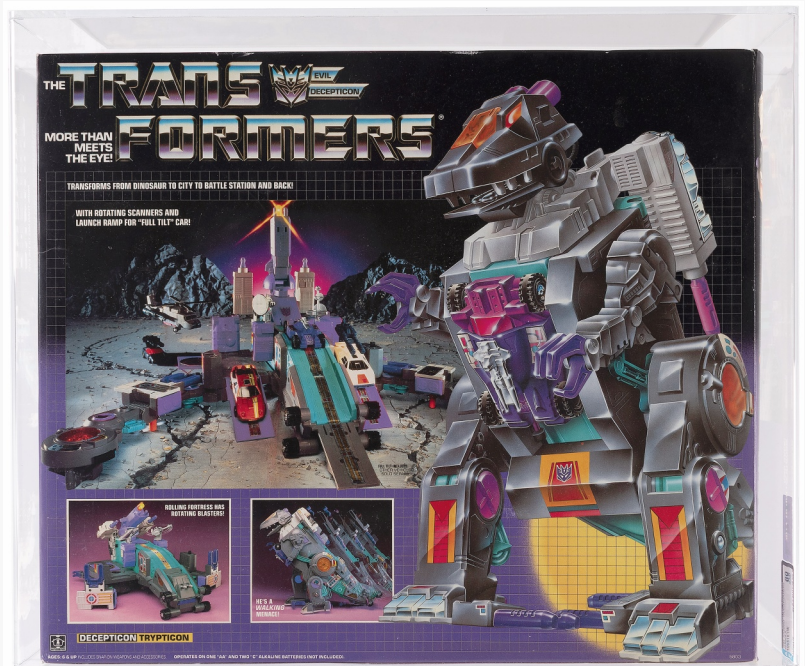
Transformers 1986 Series 3-Trypticon (Decepticon Dinosaur/City/Battle Station), AFA 80 Q-NM. First example to appear at auction. Estimate: $10,000-$20,000