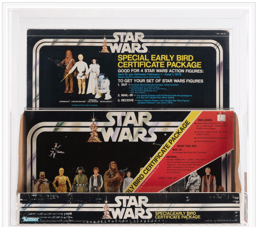
Kenner 1978 Star Wars Early Bird Special Early Bird Certificate Package store display, AFA 70 EX+. Designed to hold stiff illustrated cardboard envelopes, each containing a sealed mail-in kit. First-ever example seen at auction. Open estimate