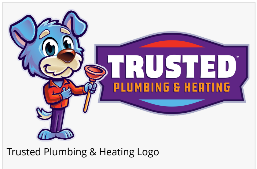
Trusted Plumbing & Heating Logo

plumbers will advertise these [$99 Drain Cleaning offers] to get people to call and book appointments, but intentionally add in other work or fees that are unclear or unneeded to increase the final cost. Not every offer like this is dishonest, of course, but I want to help Renton homeowners be aware that it can happen so they can make informed decisions.”