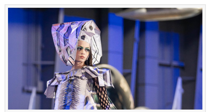
ArtPop Upcycled Fashion Show and Fundraiser

CHARLOTTE, NC, UNITED STATES, July 17, 2025 /EINPresswire.com/ -- As anticipation builds for the 5th Annual Upcycled Fashion Show & Fundraiser, ArtPop Street Gallery is proud to spotlight the regional creatives and economic impact that bring this highstyle event to life. Taking place