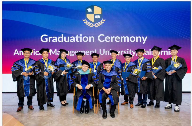
AMU graduates pose for a group shot at their graduation in Bangkok Aug 2024

Set amidst the historic charm of the Grand Hotel Saigon, this event provides an ideal backdrop to