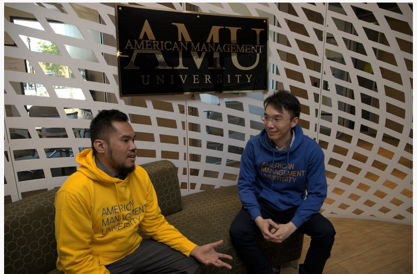
AMU students sit in front reception area of main campus office