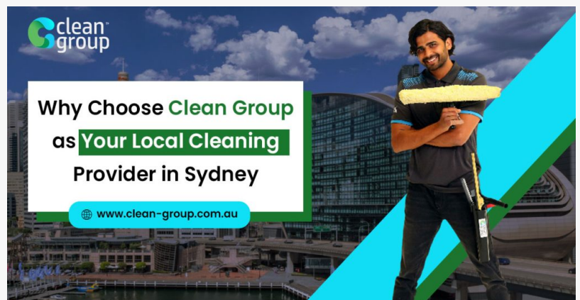
Why Choose Clean Group as Your Local Cleaning Provider in Sydney