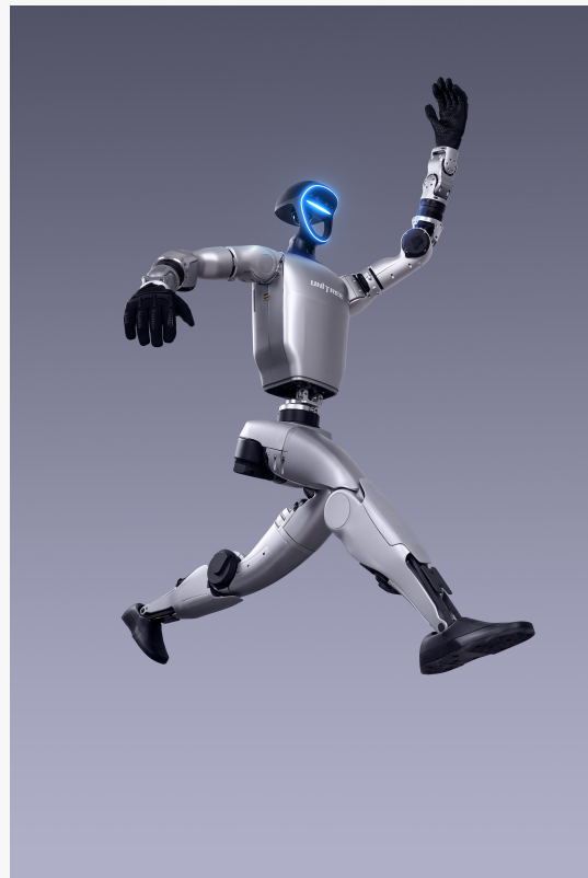
UniTree G1 Jumping