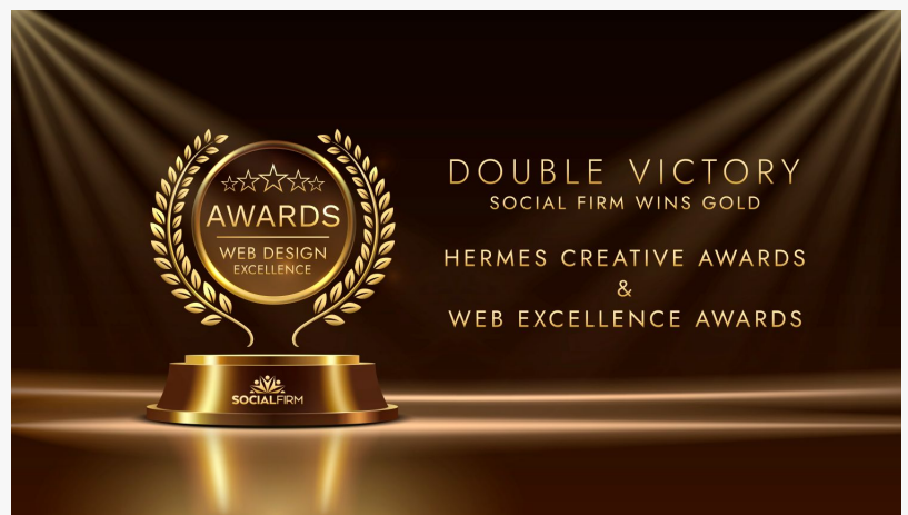
Social Firm Wins Gold at Hermes Creative Awards and Web Excellence Awards

COLUMBUS, OH, UNITED STATES, July 18, 2025 /EINPresswire.com/ -- Social Firm , a leading digital marketing and web development agency, has been honored with dual international awards for its innovative work on the Sports Imports e-commerce website . The company earned a Gold award in the 2025 Hermes Creative Awards in the Electronic Media/Social Media/Interactive Media category for Website Overall (Business-to-Business). It was also recognized as a Winner in the 15th Web Excellence Awards.