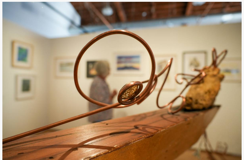
A visual meditation drawn from thirty years of quiet creation.