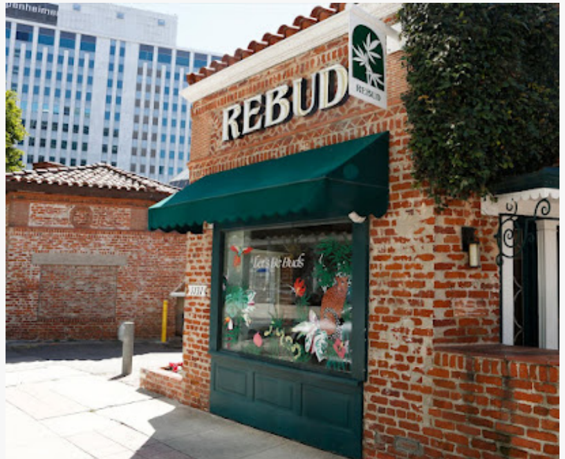
Rebud Weed Dispensary & Delivery - Westwood