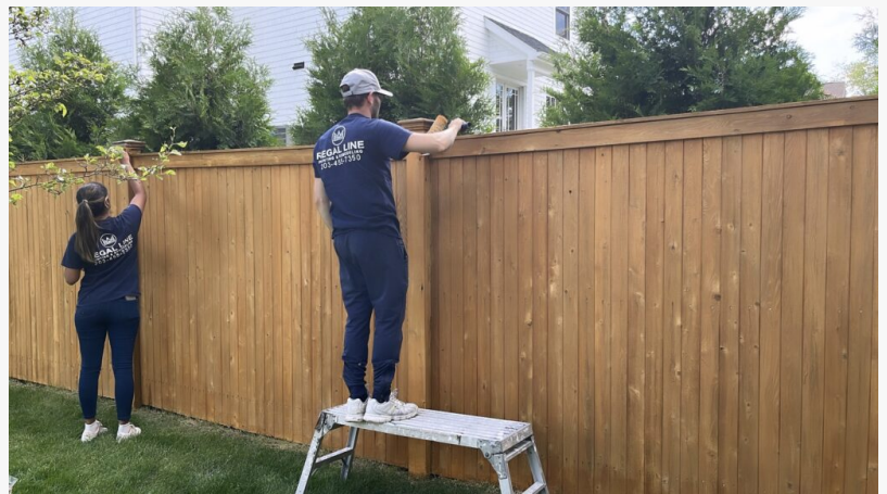
Regal Line Painting Team