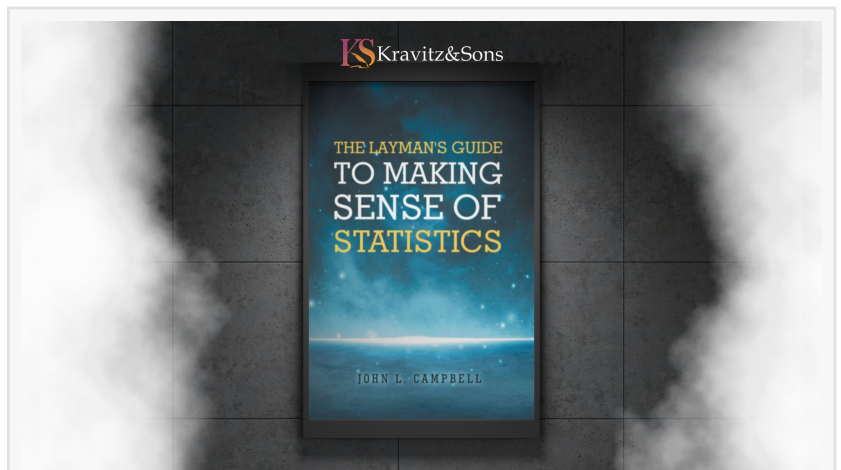
Book Banner - The Laymans Guide to Making Sense of Statistics