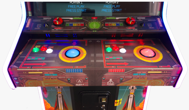
Missile Command Recharged Arcade control panel