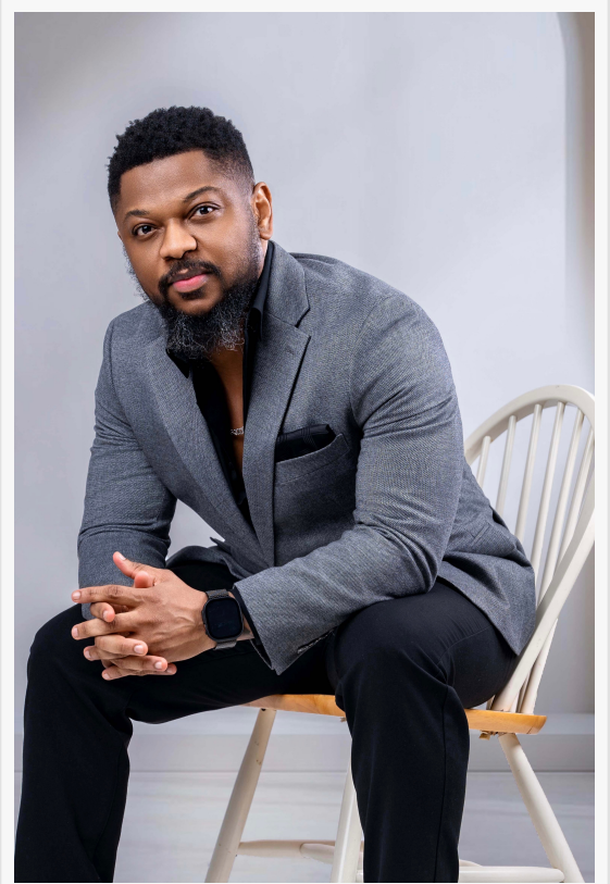
Author: Victor Eziulo Seth Seaba