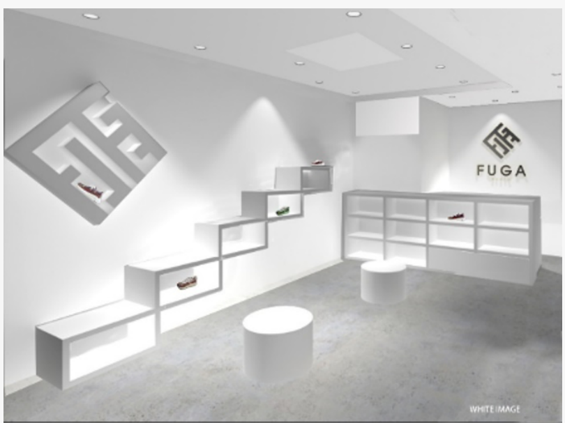
FUGA Kyoto Arashiyama