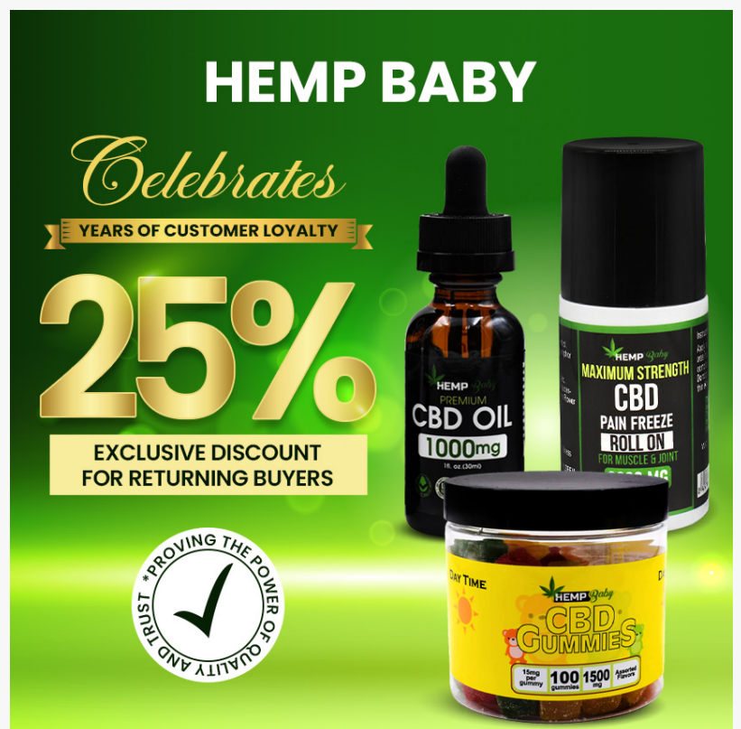
Hemp Baby Offers Discount for Returning Customers

Since its founding, Hemp Baby has built a reputation for clean, U.S.-grown hemp, third-party lab testing, and customer-first care. With consistent 5-star reviews and a loyal consumer base, the