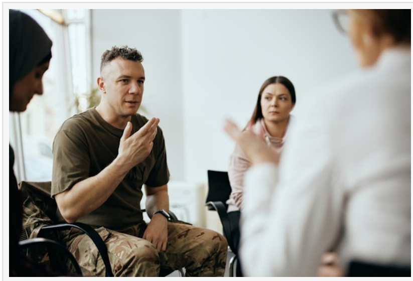
Group therapy at Asana Recovery helps veterans and their families build community, process trauma, and support one another through recovery.

TRICARE is a critical lifeline for millions, providing comprehensive healthcare benefits to uniformed service members, retirees, and their families worldwide. TriWest Healthcare Alliance plays an indispensable role in this ecosystem, managing the TRICARE