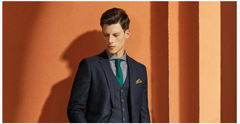
My Suit Bangkok the best custom tailor in Bangkok Thailand

My Suit Bangkok specializes in handcrafted, made-to-measure garments using premium fabrics sourced from renowned textile manufacturers worldwide. The Bangkok custom tailor creates bespoke suits and formal wear for discerning gentlemen and lady clients seeking personalized