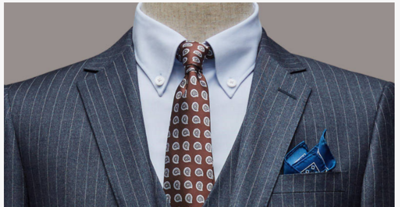
my suit bangkok_the best custom suit in bangkok thailand