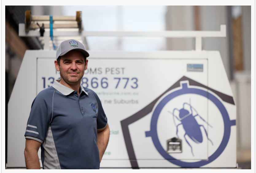
Commercial Pest Control in Brisbane

now has a clear plan, regular monitoring, and confidence that their products are protected."