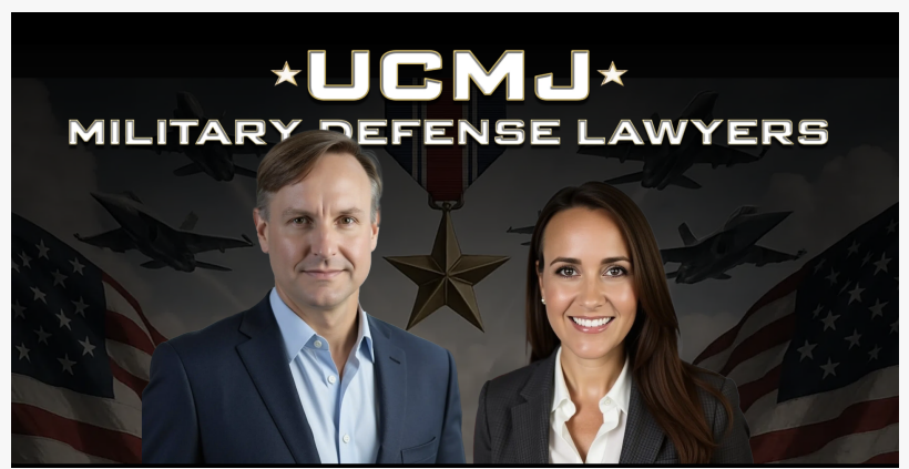
Top Military Defense Lawyers UCMJ Experts